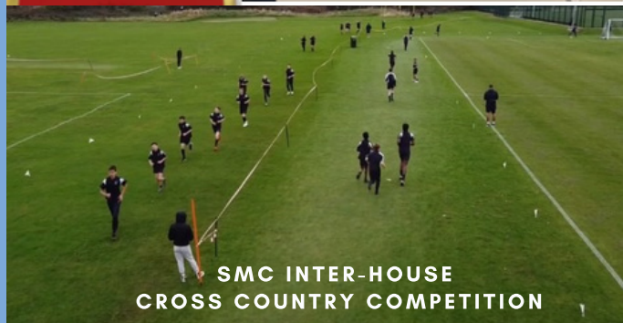
SMC INTER-HOUSE CROSS COUNTRY COMPETITION