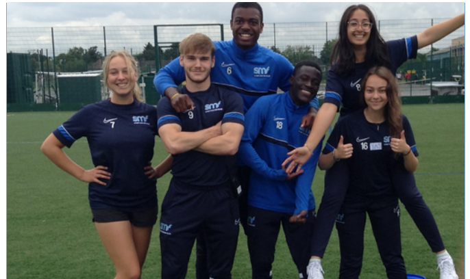
ELEVEN OF OUR SM6 COACHING AND LEADERSHIP GROUP WERE YOUNG LEADERS DURING OUR 2021 SUMMER SCHOOL. THE YOUNG LEADERS LED ALL SPORT & PHYSICAL ACTIVITY SESSIONS THROUGHOUT THE FOUR-WEEK PROGRAMME TO NEARLY 200 SMC STUDENTS. THEY WERE A CREDIT TO THE COLLEGE & DEMONSTRATED EXCELLENT LEADERSHIP SKILLS THROUGHOUT.